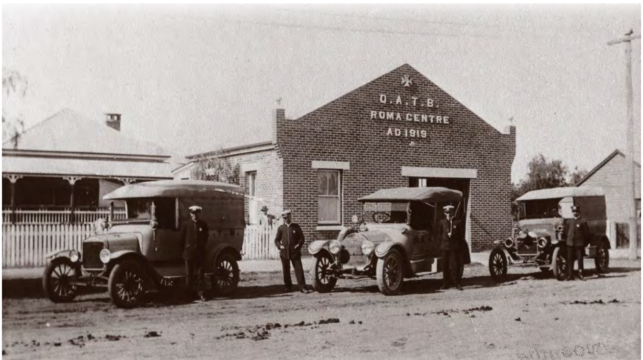
Building erected 1919