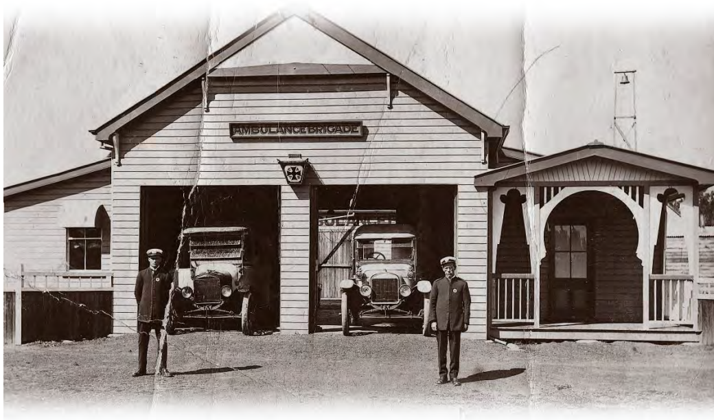
Centre building 1918