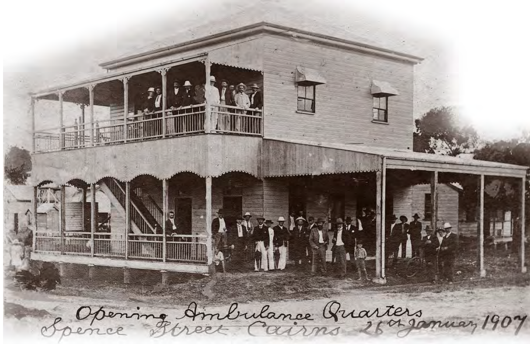
Centre opening 1907