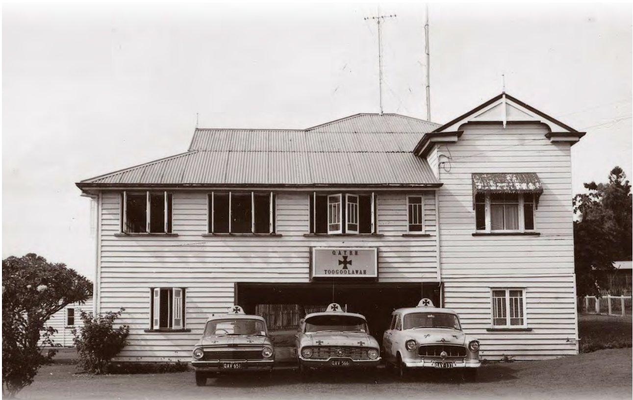
Centre building 1925-1982

In 1925 the Committee decided that as the service was firmly established it should acquire buildings in keeping with the service and have everything centralised. It was considered that the site occupied was not quite suitable.