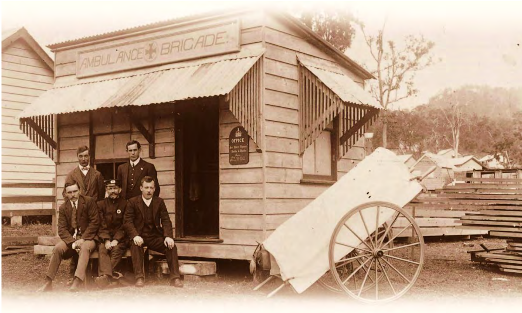
Canungra Sub-Centre 1919