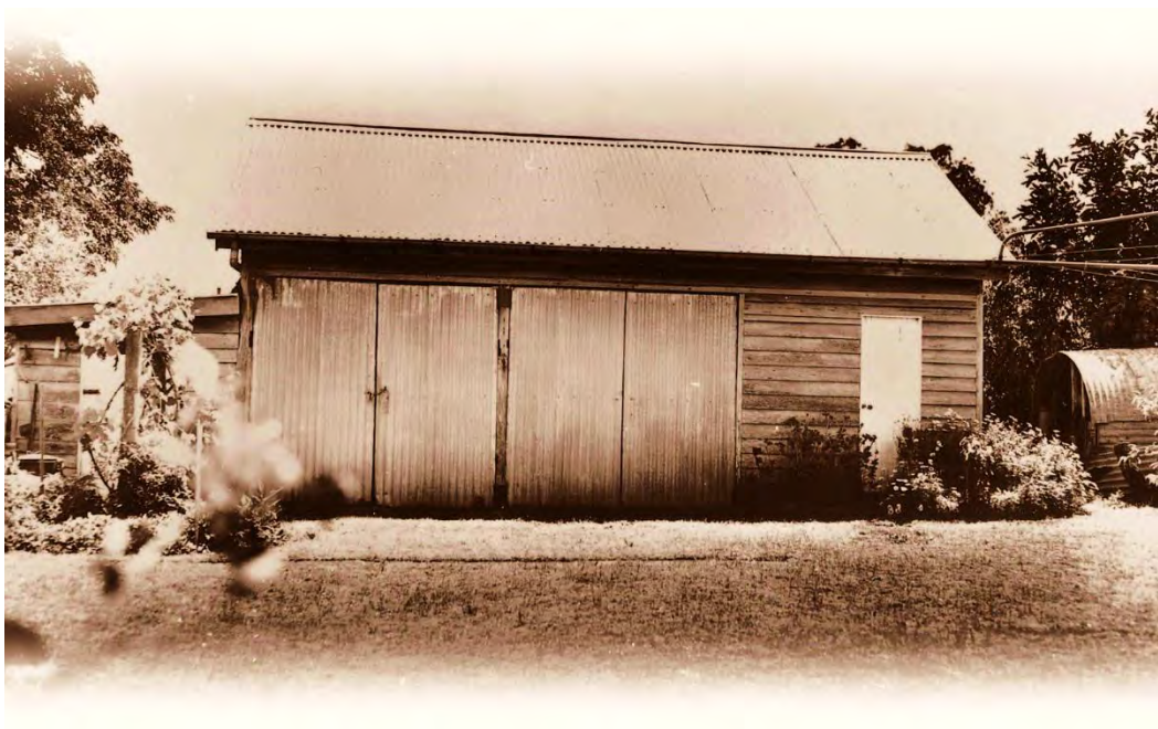
Beaudesert temporary premises 1929