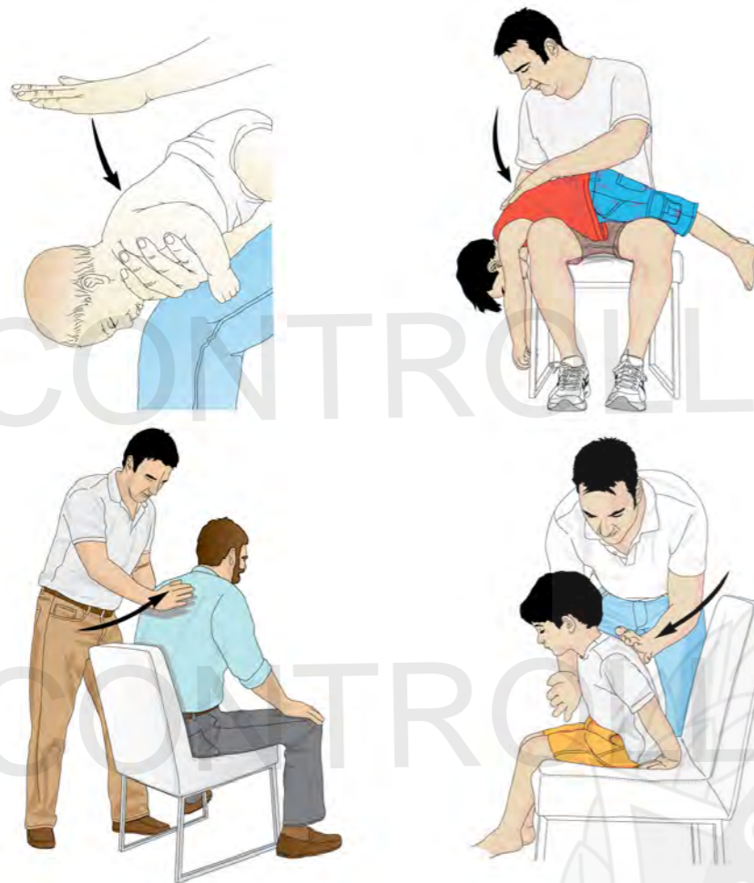
Examples of back blow technique