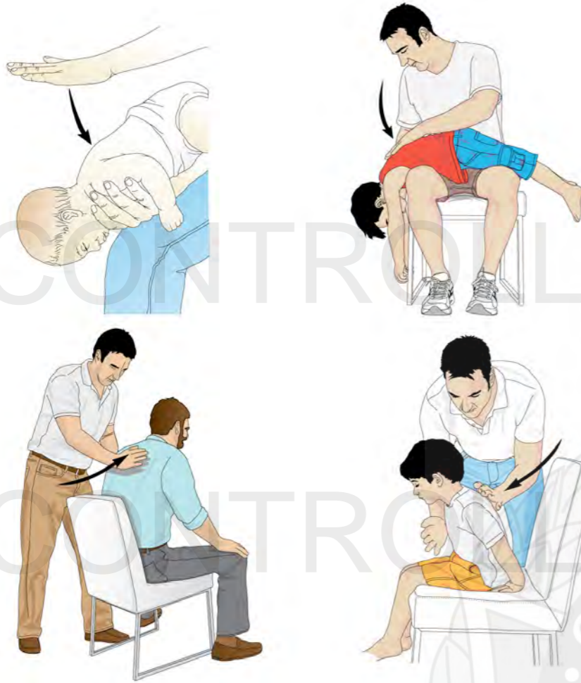
Examples of back blow technique